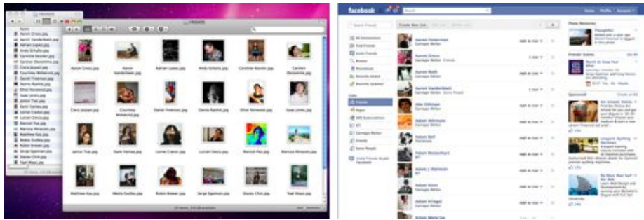
Fig. 2. Left: Screen capture of possible view options and friend photos in the file hierarchy mechanism. Right: Screen capture of Facebook’s edit friends page, with the friends tab selected.