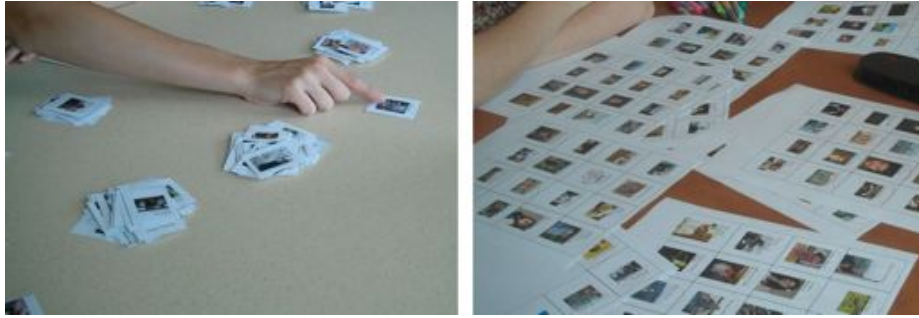
Fig. 1. Left: A participant using the card sorting mechanism points to a group of one friend during the privacy scenarios section of the interview. Right: A participant using the grid tagging mechanism reviews her friends, after having tagged them with colored markers during the privacy scenarios section of the interview.